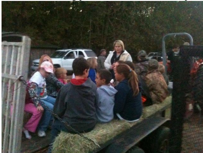
Southern Flight's Fall Social hayride in motion