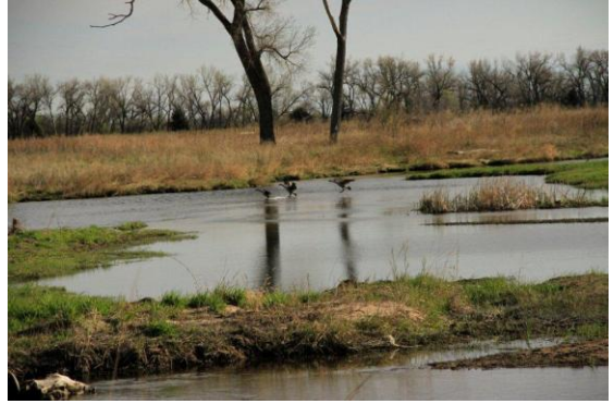
Live decoys during the Finished hunt test.

1 ½ months before the test Finished was sold out. This was our first year we had two (2) flights of Finished. The result? We were totally finished with all tests by 2:30 on Sunday. 138 dogs from eight (8) states were represented that weekend.