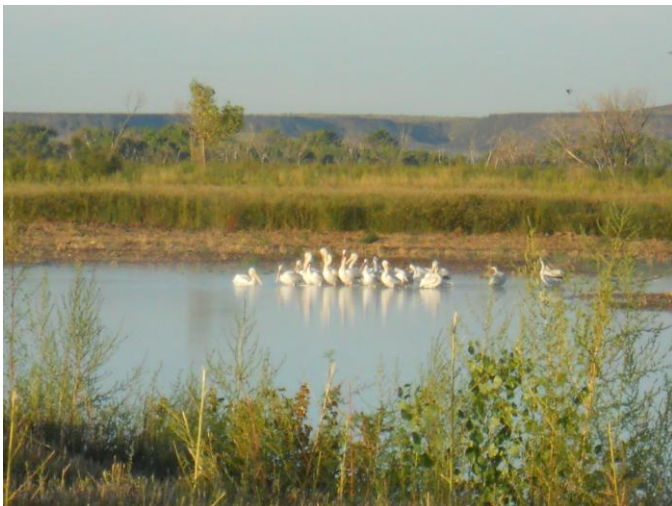
Pelicans at Bosque del Apache NWR