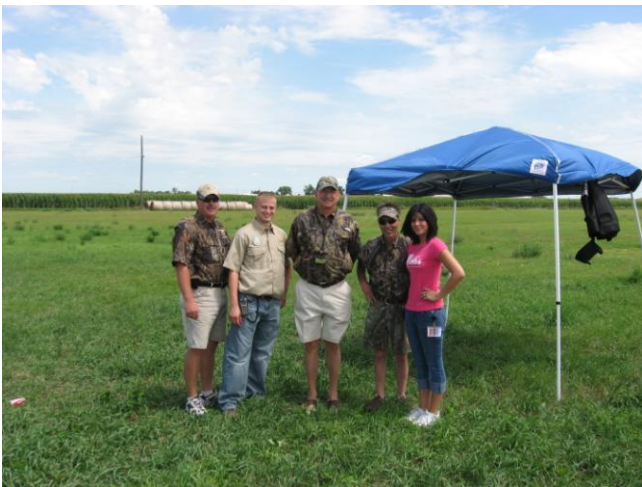
"DOG DAYS AT CABELA'S."