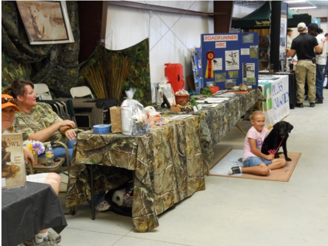
Roadrunner HRC display at the NM Outdoor Expo. Those brochures on the National CD were great!

Thanks to everyone who ran a dog, judged, threw birds, cooked or worked so hard behind the scenes to make this event happen.