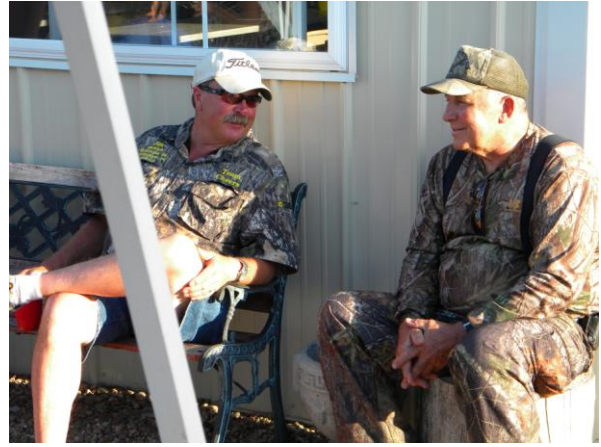
Just hangin' out...'Good times with ole friends'